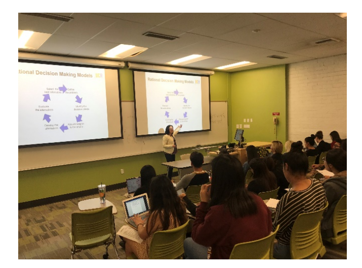
Figure 2. GIS has been used in three main ways in education.

First, GIS is used as a standalone subject to be studied in its own right. This takes shape as a body of content, manifested in learning a set of tools and understanding the technology theoretical application of spatial information. This typically occurs as part of a GIS or GIScience program in a university or, less commonly, a secondary school (Figure 2). Less commonly, it is housed in a social or natural science program. In community and technical colleges, it is often a standalone program focused on helping students develop key workforce skills that can be applied to solve problems.