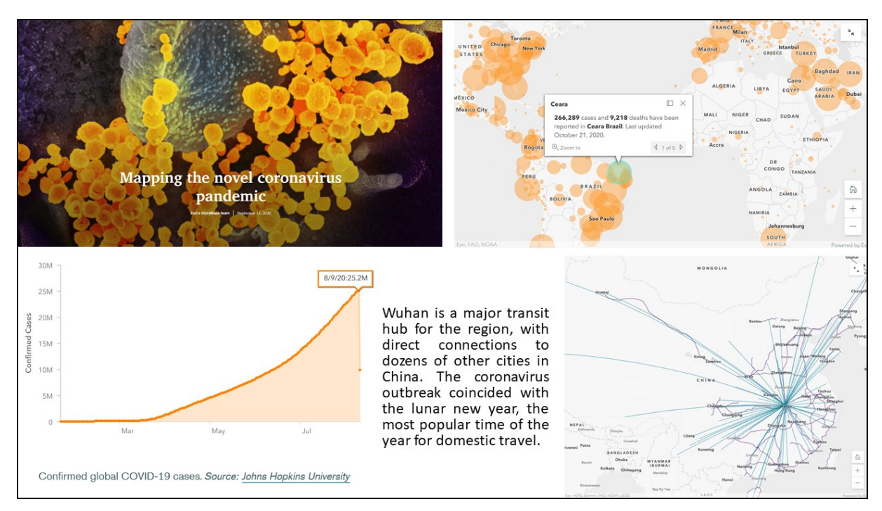
Figure 6. COVID-19 story map.