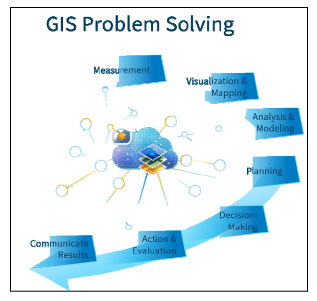
Figure 3. Workflow for GIS includes steps of observing, understanding, responding and communicating.

This is the case for hundreds of other tools and processes that are easy-to-follow and yet offer options for customization. Second. instructors began to realize that they no longer needed to screen shot every procedure. In fact, if they do, they will be caught in a never-ending curation task as GIS tools continue to evolve. In the past, instructors had to create their own graphics and screenshots because these were by and large the only resource that students had access to. Nowadays, if a student gets stuck on a certain section, they can get help from online videos and tutorials, or the community of GIS users. Furthermore, resourceful students no longer read screen shots very much, if at all: They know that other resources exist and will find them if they have difficulty. Thus, instructors began to realize that they should spend less time updating procedures, and spend more time implementing new curricular ideas and teaching techniques.