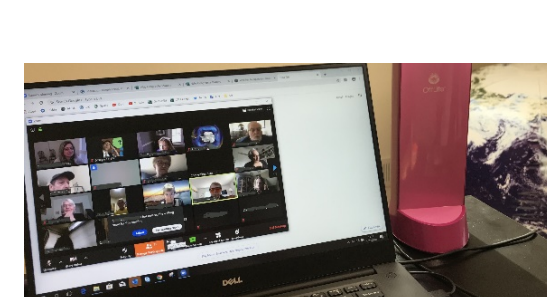
Figure 1. The most immediate impact of COVID-19 on education was to require courses and entire programs to online mechanisms.

Geography educators made adjustments to their courses in several ways. They took steps to ensure that their textbooks were accessible fully or partly online and made substitutions if they were not. They supplemented traditional paper maps and charts with digital ones, including those made with web GIS. They shifted activities to those that could be supported by Learning Management Systems (LMS), such as Canvas, Blackboard, or Schoology, and made extensive use of conferencing and webinar tools such as Zoom or GoToMeeting.