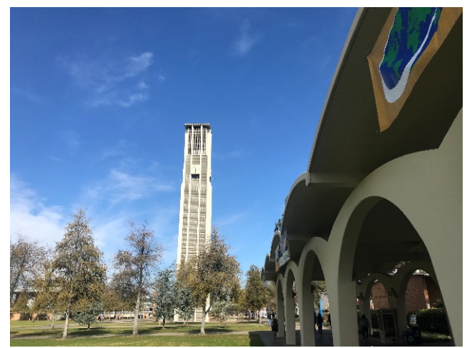
Figure 4. A typical educational campus contains numerous buildings and thousands of flows that continually change.

The spatial decisions necessary during COVID-19 include understanding layouts and spaces to choose sections of dormitories and classroom buildings to reopen, optimal temperature screening locations, placing and restocking sanitizer stations, personal protective equipment stations. isolation areas. room capacities, distancing options, estimating crowd capacities, cleaning regimens at cafeterias and gymnasiums, reporting COVID-19 related problems and status, and many more.