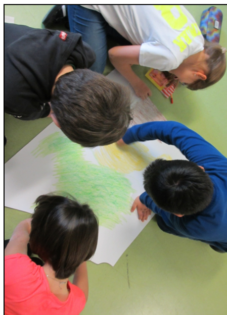
Figure 2. Pupils at work to create their own country.

It was proposed to each group of pupils to create a country with specific characteristics (urban system, cultural and economic elements, resources). Some indications were given to each group by the teacher: indications about some physical elements of their future country (i.e. percentage of mountains, waterways and rivers in pie charts), basic urban organization, food and resources. Other elements were chosen by each group: currency, traditions, transports, flag, country name (for example one group created this name from the initial letters of the name of each member), the location of towns and road infrastructures, typical features of cuisine and cultural traditions, the form of government. In this way each group created its own country (Figure 2).