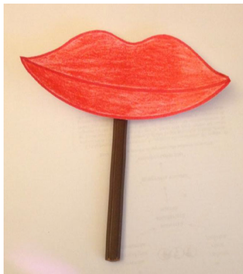
Figure 4. The “speaking mouth” used by students during discussions.