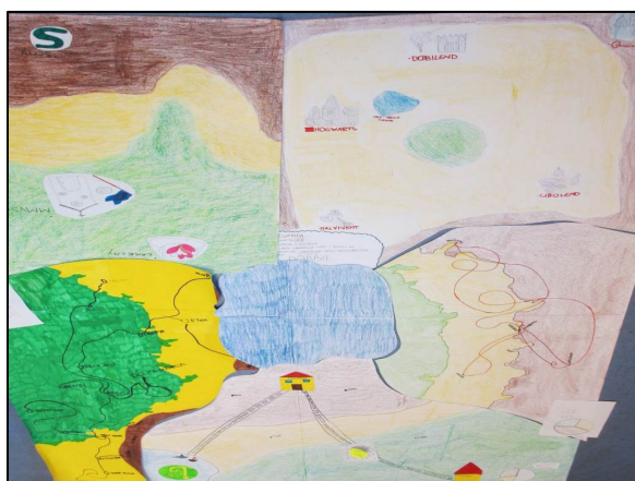
Figure 3. The regional area created by pupils localizing the individual five countries around the lake.

Afterwards, pupils had to find solutions. They discussed which solutions could be more interesting for the environment and for the local population. Some different behaviors emerged. One group chose “to fight” against the country that caused the imbalance and kidnap the president. A “peace keeping” action was the second reaction: one country thought about the possibility of exchanging agricultural products with the fish resources of the problem-causing country. This solution was elaborated by comparing the different statistical data regarding the availability of agricultural products (pupil: “Since you have only 8% of crops and we have a lot of it, we can sign an agreement for an equal exchange of crops and fish. We can find together the rules”).