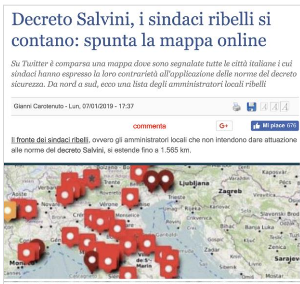
Figure 5. Acknowledging the map on national press.

The map also became a tool to recall the resistance beyond its concrete presentation: in the webpages of Internazionale , the map lives in the form of a mere link (Figure 6).