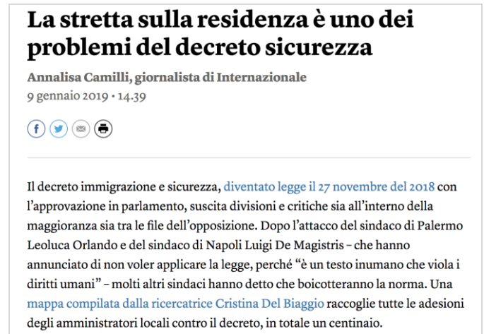
Figure 6. Linking to the map.

The map also became a tool to recall the resistance beyond its concrete presentation: in the webpages of Internazionale , the map lives in the form of a mere link (Figure 6).