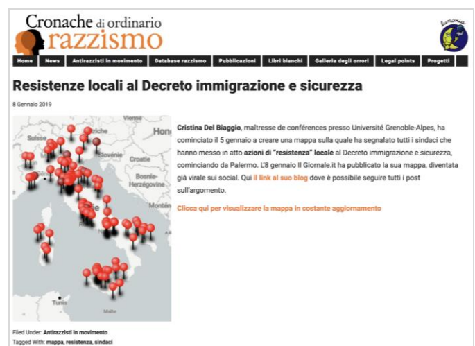
Figure 7. Symbolising the map.

Beyond its proper visualisation, the map has come to symbolise an anti-racist standpoint (Figure 7). Living in the Web through different forms of mediation, the map began not only to attract comments but it came also to activate relations and “inter-actions” (Figure 8).