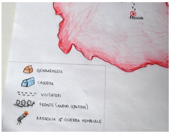
Figure 2a and 2b. The layered paper literary map and a zoom of its legend. For a translation of the legend, from top to bottom: gendarmerie; barracks; visitors; front (new border); First World War battle.

Analysing the cartographic evidence reveals two different graphic strategies pursued to represent narrativity and time. The first graphic strategy is layering, and it is pursued to communicate time; the second strategy is the particular use of scale, and it deals with the plot of the story. In this pencil-and-paper map, the narrated place is mapped as part of a larger section that stands as the spatial context added by the authors of this literary map. The inn and its surroundings, as the protagonists of the story, are framed and layered and have a larger scale. Concerning the scale, the students used it as a graphic, metaphorical strategy to bring readers' attention to the spatial protagonist. In this literary map, the scale is a visual narrative feature aimed at making the inn and its surroundings emerge from their spatial context. Geovisualising space using different scales makes narrative evidence either emerge or be overshadowed; scale can be used as a visual