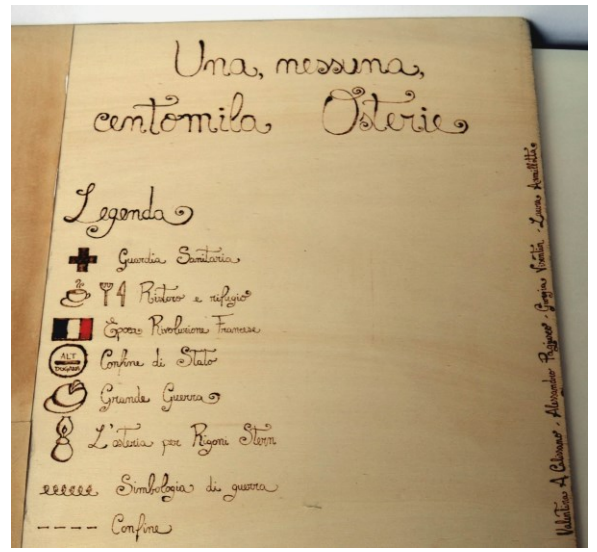
Figure 3b. The legend is the only element that resembles a map. From top to bottom: sanitary guard; refreshment and shelter; French Revolution epoch; national border; First World War; Rigoni Stern's inn; war simbology; border.

In all of the literary mappings undertaken, the students' ideas of a map are extremely mobilised (see also the first literary mapping analysed). The literary map in this case is not a tool that orients in space but a tool that orients (authors