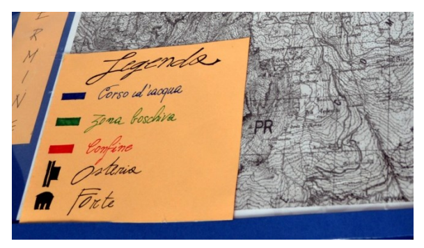
Figure 6a and 6b. The layered literary map and its legend. The layers overlap and continue to relate during the map reading. For a translation of the legend: rivers; forests; border; inn; fort.

Moreover, the layers not only overlap but also keep interrelating due to their transparency. Beyond materiality, the layers have a metaphorical value that affects the construction and possible reception of the map. The temporal layers (each layer corresponds with a specific time) continually interrelate and make the map more than the sum of its parts.