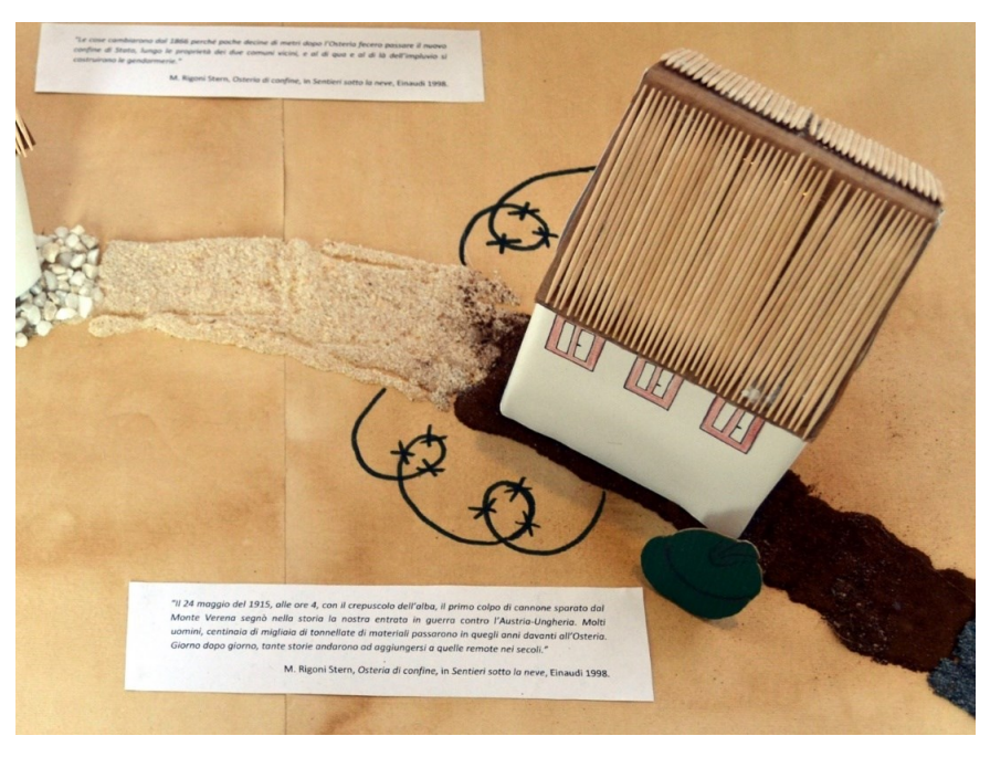
Figure 4. The literary words relate to the material inn on the plan.

Concerning the graphic output, the different shapes through which the inn appears embed the passage of time in their changes on the cartographic plan. Moreover, time is visualised in the changing of the street as a spatial element that "beat the most meaningful periods of the history of the building' (as written in the students' paper). In this case, the map represents coexistence: all the possible and the narrated inns coexist on the "map", continually relate to each other and, from the reader's point of view, seem to be part of the same crystallised time. In the paper, the authors make a useful comparison between the map and the short story: both overcome time and are able to show otherwise impossible coexistences. The different inns coexist on the plan, along with the textual accounts that make them narratively readable and understandable (Figure 4).