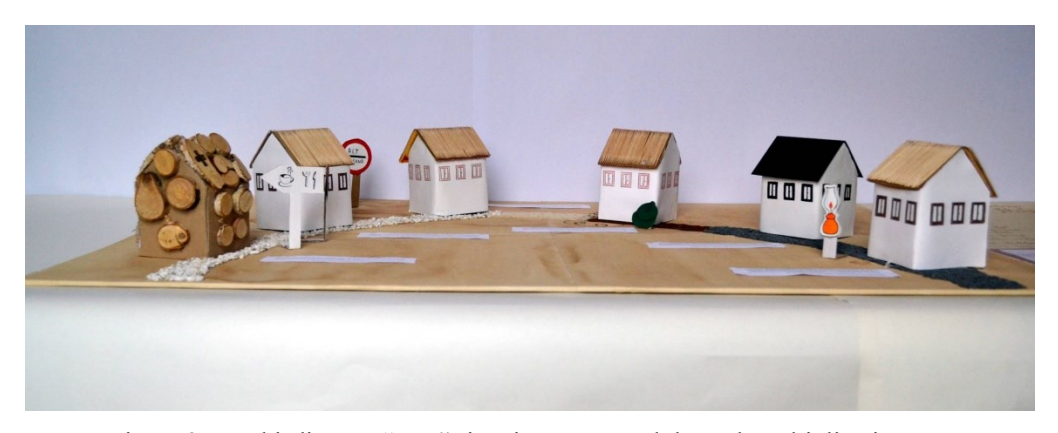
Figure 3a. In this literary "map" time is represented through multiplication.

First, reflection on this literary mapping is necessary. Indeed, this literary map has no cartographic traits; nothing seems to be mapped on it. Nevertheless, the students call it a "map" and provide it with a legend, too (Figure 3b).