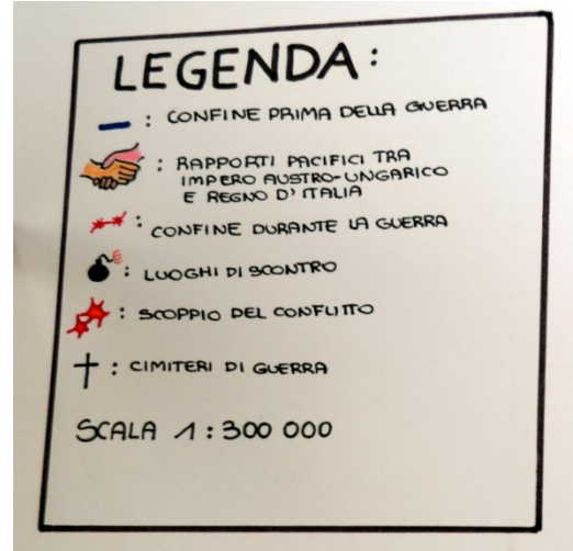
Figure 1a and 1b. The literary map and its legend.

Trying to think about how to geovisualise the dialectic between inside and outside helped the students think about what this dialectic means. When paying attention to the temporal category, the authors decided to focus on one of the narrated times: the First World War. Time is represented by the small map, drawn from two overlapping layers that represent the Plateau before and during the war. At the intersection of these two layers, it is possible to visualise the border changes and the military and political resignification of places. The passage of time is embedded in the graphic relation between the coloured base map and the transparent paper layer.